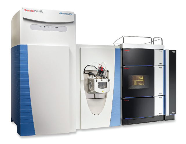
Q Exactive HF-X mass spectrometer with H-ESI II ion source and Thermo Scientific™ Vanguish™ UHPLC System